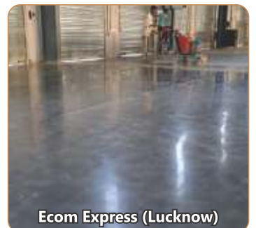
Ecom Express (Lucknow)