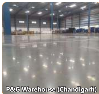
P&G Warehouse (Chandigarh)