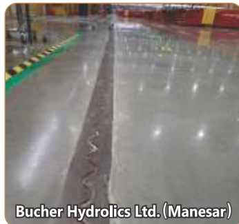
Bucher Hydraulics Ltd. (Manesar)