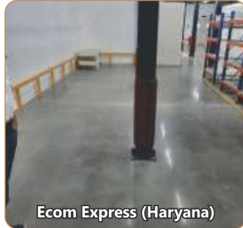
Ecom Express (Haryana)