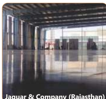
Jaquar & Company (Rajasthan)