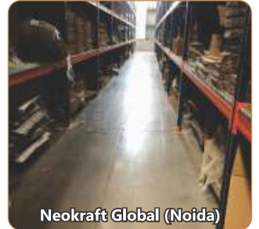
Neokraft Global (Noida)