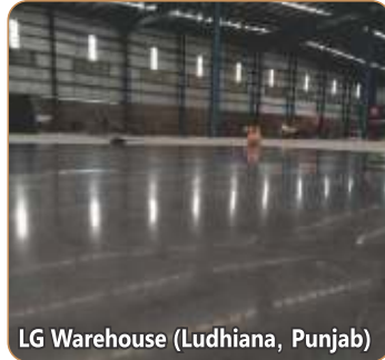
LG Warehouse (Ludhiana, Punjab)