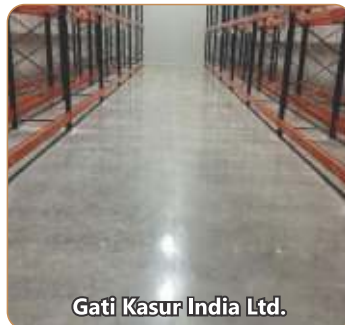
Gati Kasur India Ltd.