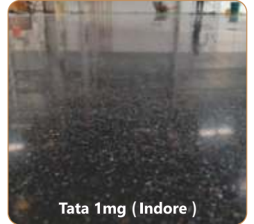
Tata 1mg (Indore)