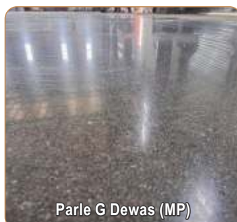
Parle G Dewas (MP)