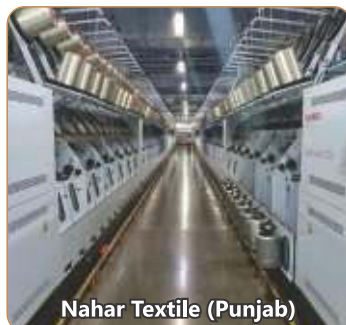
Nahar Textile (Punjab)