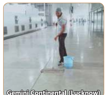
Gemini Continental (Lucknow)