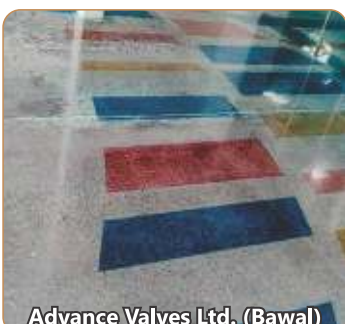
Advance Valves Ltd. (Bawal)