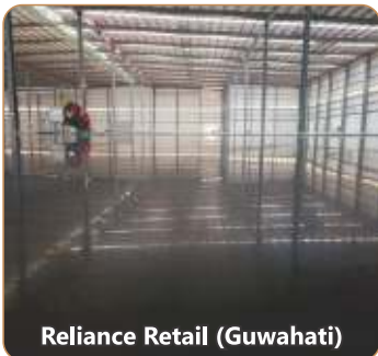
Reliance Retail (Guwahati)