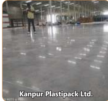
Kanpur Plastipack Ltd.