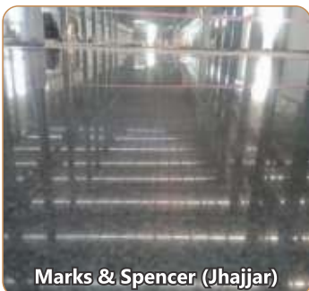
Marks & Spencer (Jhajjar)