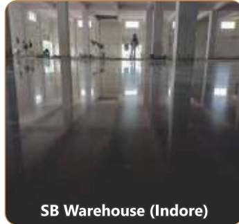
SB Warehouse (Indore)