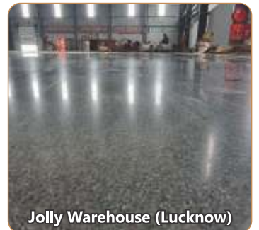
Jolly Warehouse (Lucknow)