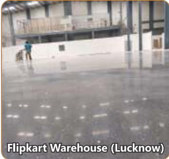
Flipkart Warehouse (Lucknow)